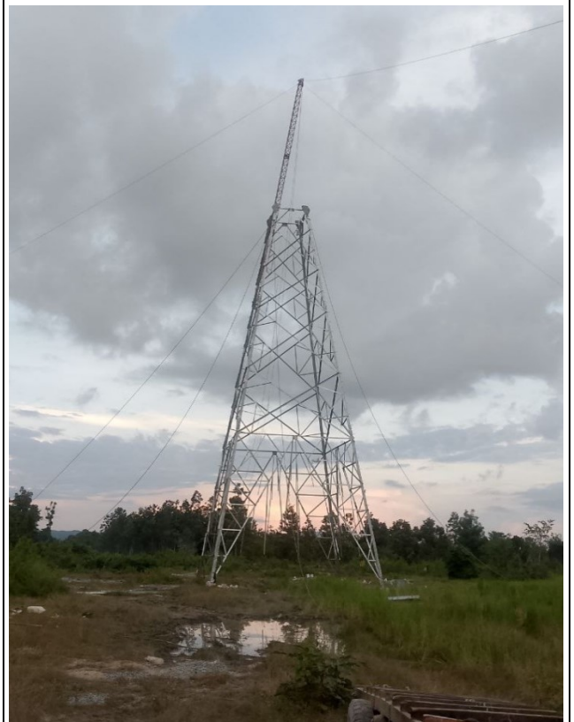
T-A193-1 Erection completd.