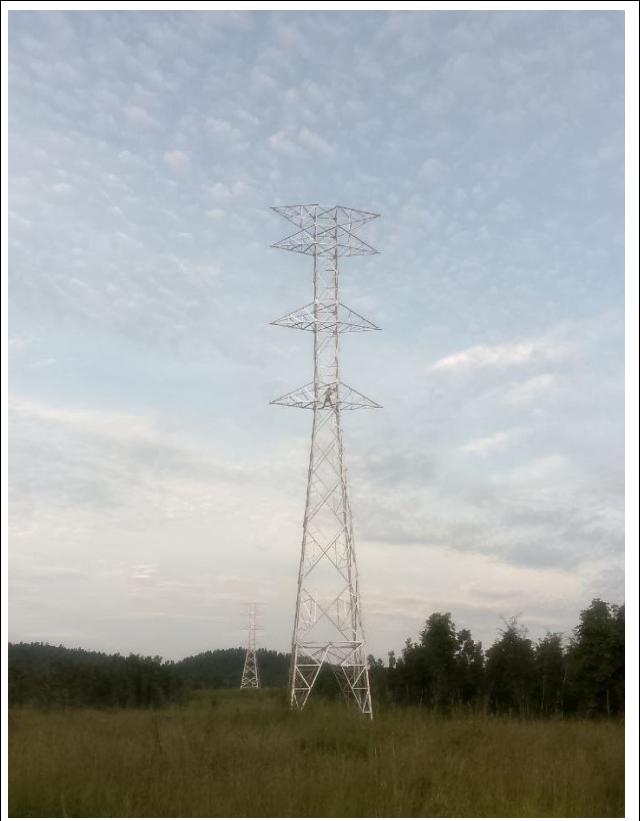
T-A189 Erection completd.