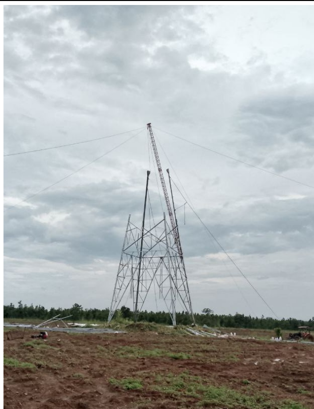
T-A182 Tower erection.