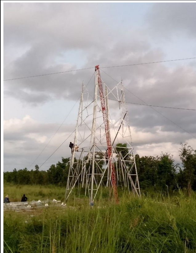
T-A189 Tower erection.