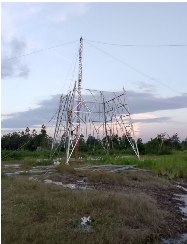
T-A193-1 Tower erection.