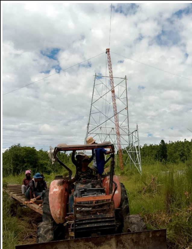
T-A186 Tower erection.