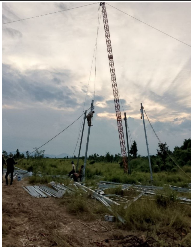
T-A190 Tower erection.