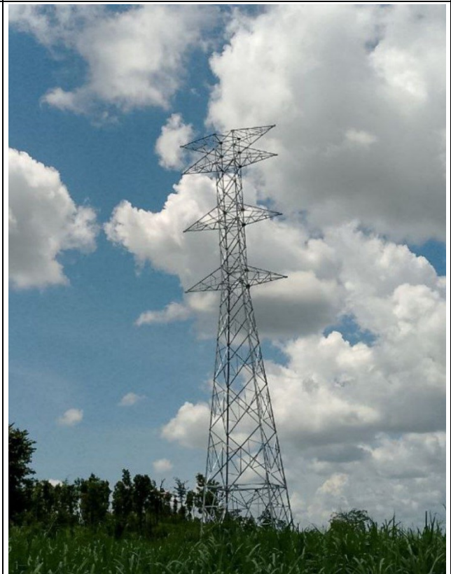
T-A183 Erection completd.