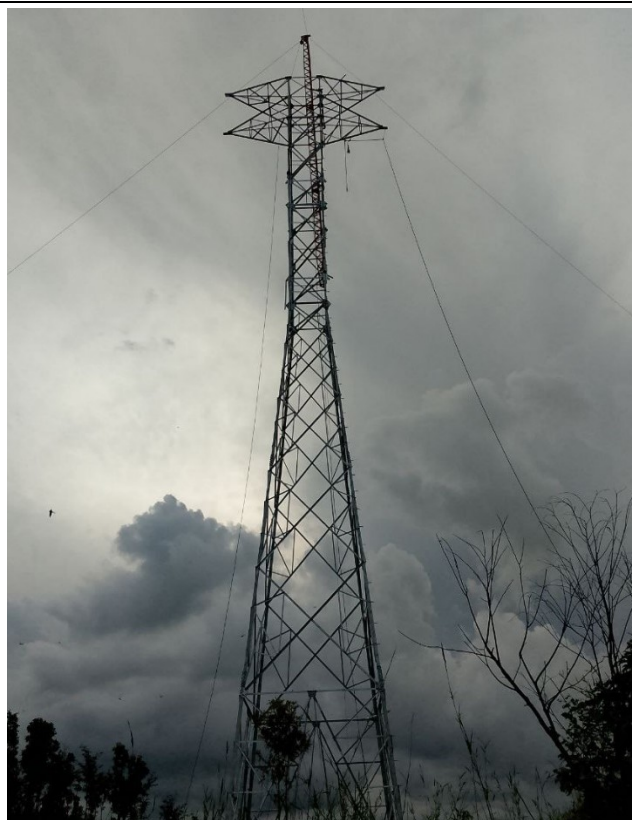
T-A183 Tower erection.