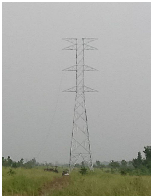
T-A190 Erection completed.