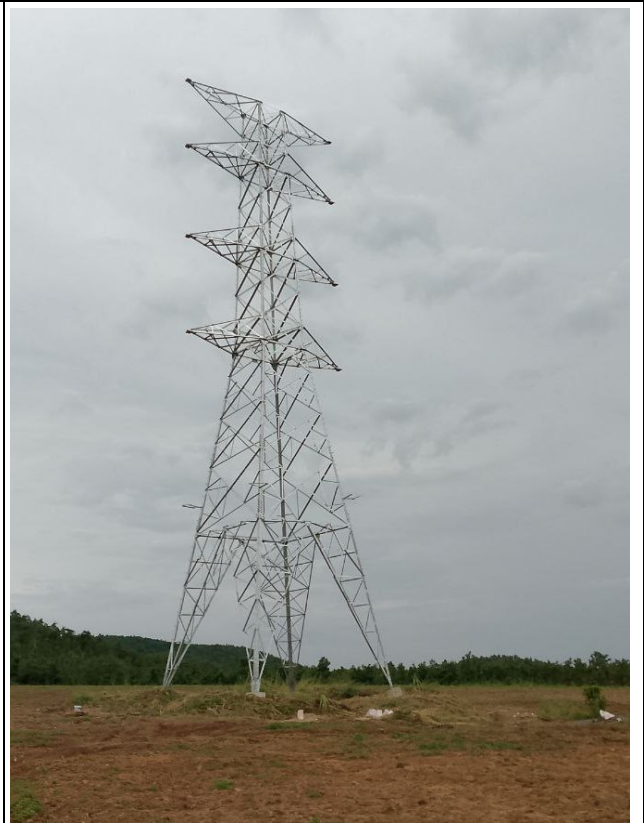
T-A182 Erection completed.