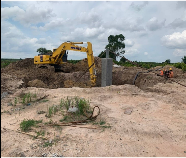
Soil backfills of the leg A, B, C, D