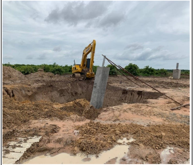
Soil backfills of the leg A, B, C, D