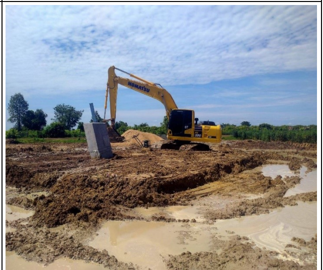
Soil backfills of the leg A, B, C, D