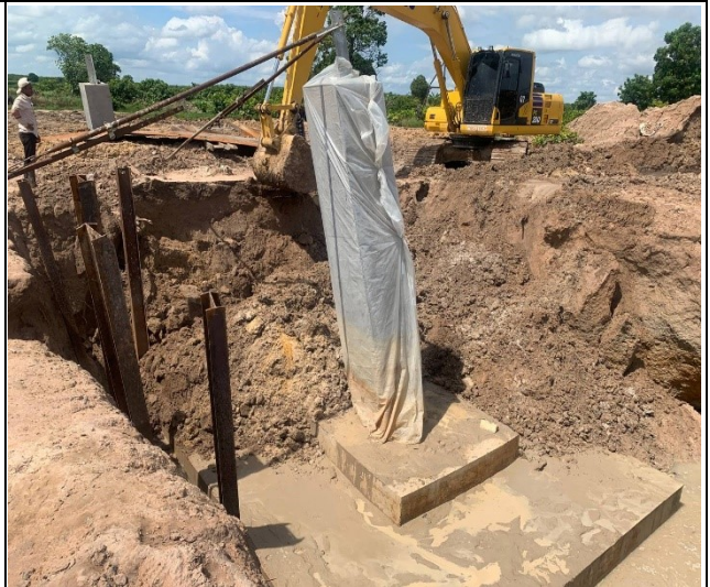
Soil backfills of the leg A, B, C, D