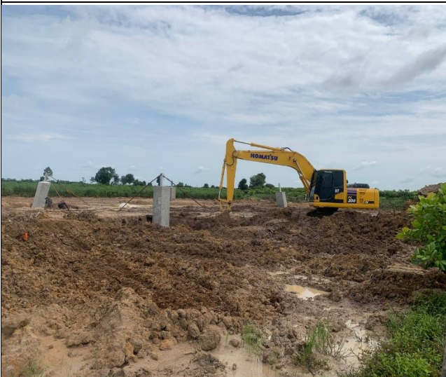
Soil backfills of the leg A, B, C, D