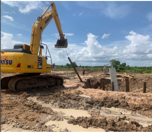
Soil backfills of the leg A, B, C, D