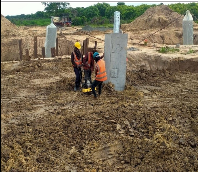
Soil backfills of the leg A, B, C, D