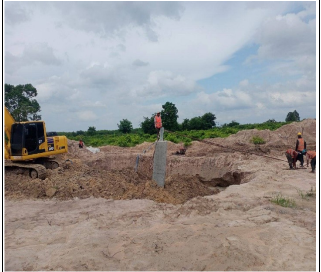
Soil backfills of the leg A, B, C, D