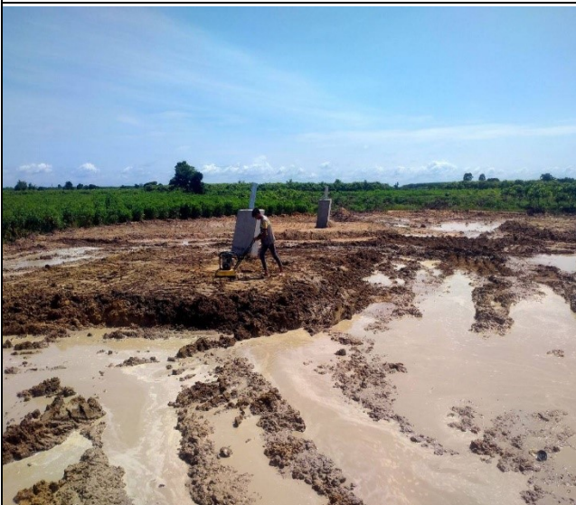
Soil backfills of the leg A, B, C, D