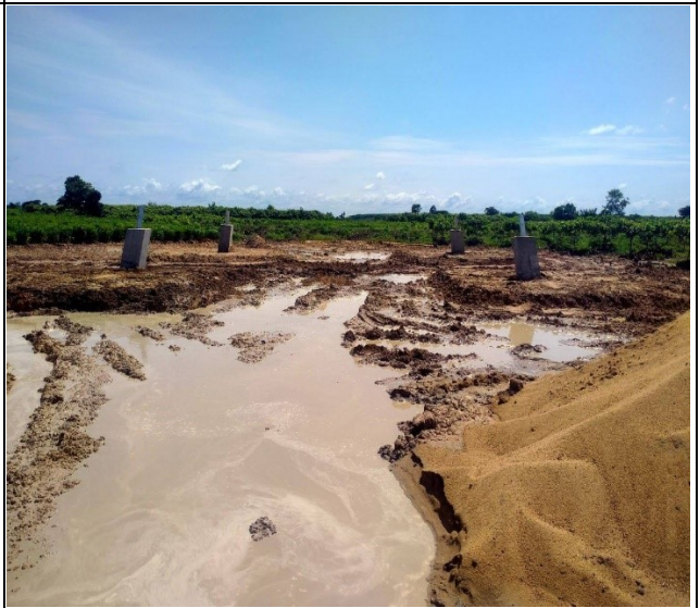
Soil backfills of the leg A, B, C, D