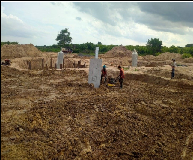
Soil backfills of the leg A, B, C, D