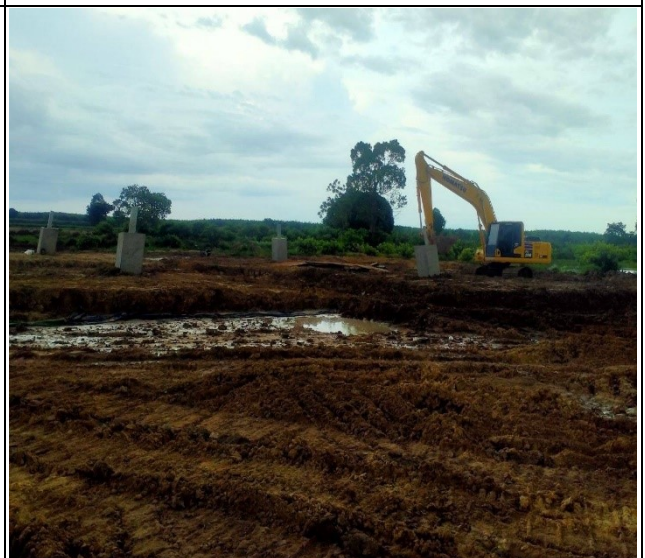
Soil backfills of the leg A, B, C, D